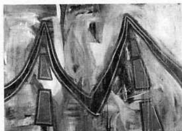
Albert Oehlen: Untitled (Streets) 1988 Oil on canvas 108-3/16 x 147-9/16 inches (488)

freedom and confinement. Stretching beyond the horizon, it promises infinity yet it is part of a grid defining space." She has said how each of her grandfather's images "reflects a desire to transcend those boundaries, to discover that point of infinite space." Silent and bereft of narratives the viewer is left to project their own imaginings and narratives onto these photos of the open road.