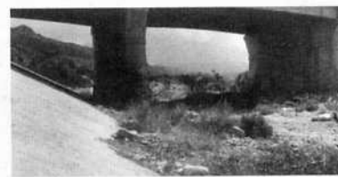
Ask the Dust: Them (1954/1991) 1991 Black and white photograph 14-1/2 x 23 inches 1 of 21 parts