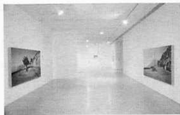
Cindy Bernard: Two Roads 1991 Two colour photographs mounted on wood panels 46 x 85 x 3 inches each Installation view: "Not Painting: Some Views from the Permanent Collection", Museum of Contemporary Art, Los Angeles, 1994

Installation views: "Nothing Sacred" Organised by Cindy Bernard and Brad Dunning Margo Leavin Gallery, Los Angeles, 1987