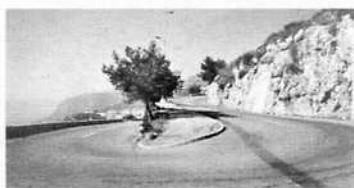
Cindy Bernard: Two Roads 1991 (detail)